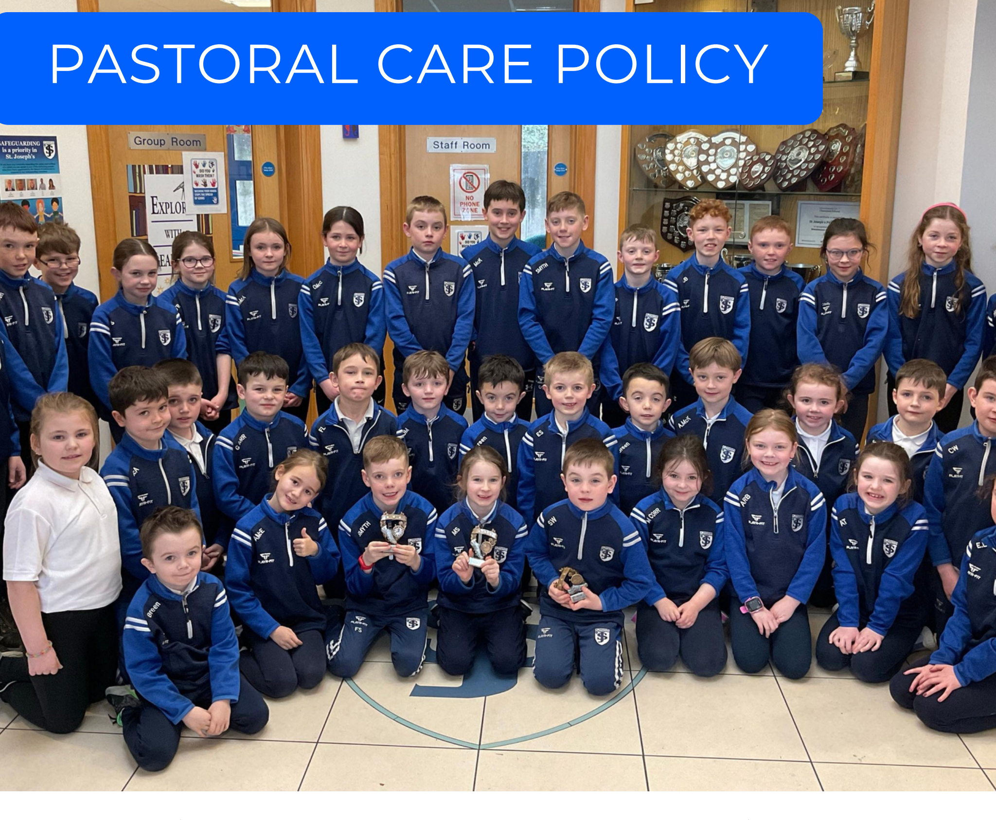
At St. Joseph's Primary School, pastoral care permeates all aspects of school life.

It reflects the values, attitudes, beliefs and practices of our Catholic faith and involves all members of our school community – Board of Governors, teachers, children, parents and all other adults who contribute to the well being of each child. We encourage pupils to discuss issues of concern that they may have through class Circle Time activities and also through our effective Kidscape programme. St. Joseph's Primary school is a caring, responsible school with the children at the core of our activities. We strive to respond to the personal, emotional, social and educational needs of our pupils through our interaction with them in the classroom and beyond.